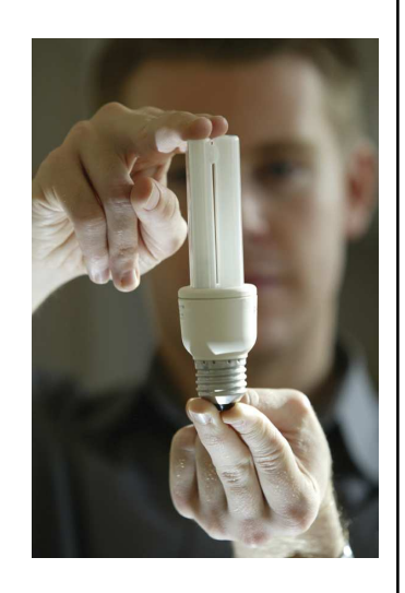
Water Energy Land